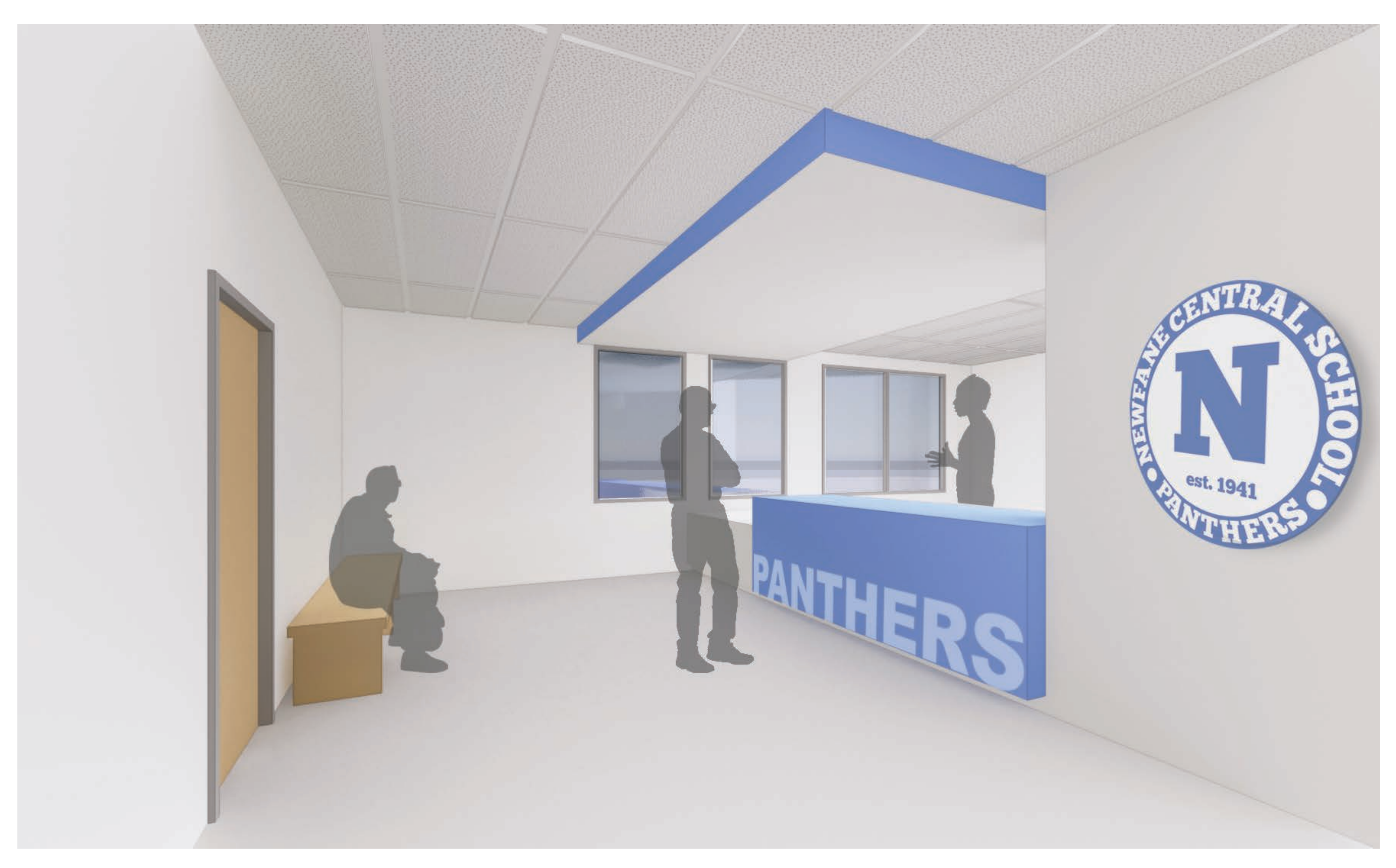
MULTI-LAYERED SECURE BUILDING ENTRANCE AND MAIN OFFICE RECONFIGURATION

In addition to reconfiguring the main entrance to route all visitors through a renovated Main Office, "hardening" the foyer, and replacing the hardware and refurbishing all the classroom doors with quick locking mechanisms, we will be continuing the roof replacement at the Middle School, resurfacing some parking lot areas and driveways and replacing the exterior building doors on the bus circle. Both the boys and the girls locker rooms will get a facelift, as well as the spectator bathrooms near the track. The project also provides funds to convert the current district signboard, generously donated by the PTSA in 1997, to a digital display format. All the work at the middle school will be designed to maintain the historical integrity of the building under the supervision of the NYS Historical Preservation Office.