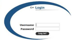
Parent Portal Login Screen